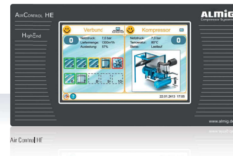
Air Control HE