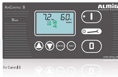
Air Control B

Using the ALMiG AIR CONTROL family of controllers you can control, manage and monitor your entire compressed air supply system in the best possible way.