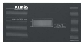
Air Control Mini